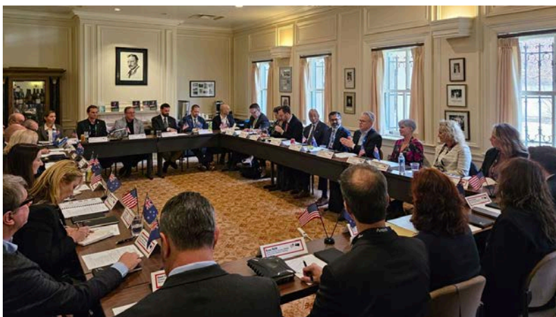
Director DalBello offers welcoming remarks during the U.S.-New Zealand commercial space roundtable held at the Space Symposium Conference.

Later that week, back in Washington, D.C., OSC participated in the inaugural U.S.-New Zealand Space Dialogue, which featured a day of discussions underscoring the robust cooperation between the United States and New Zealand in outer space. Read the joint statement of the dialogue here .